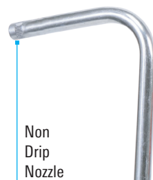
Non Drip Nozzle