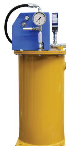
20L Bulk Fill Pump Station