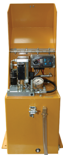
Heavy Duty Low Profile Hydraulic Pump Station