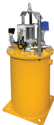
40L Bulk Fill Pump Station